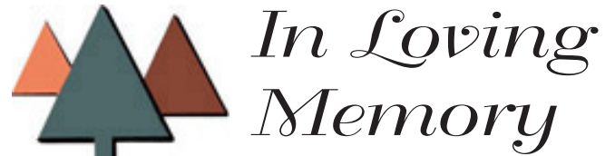
Robert England #13